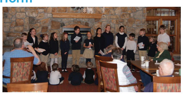
Children from St. Catherine of Siena Academy entertain with a holiday concert.